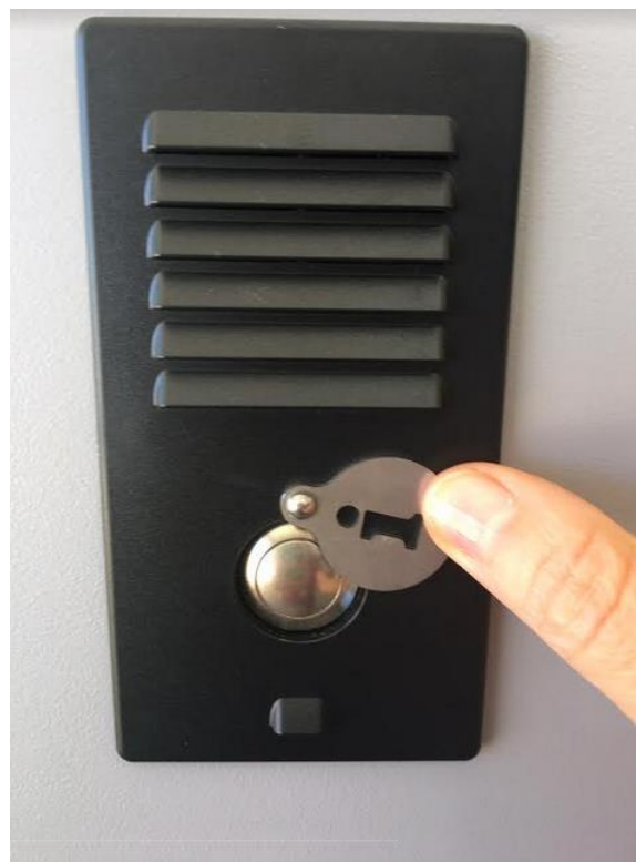
Swing the "i" cover aside and press the intercom button for assistance.